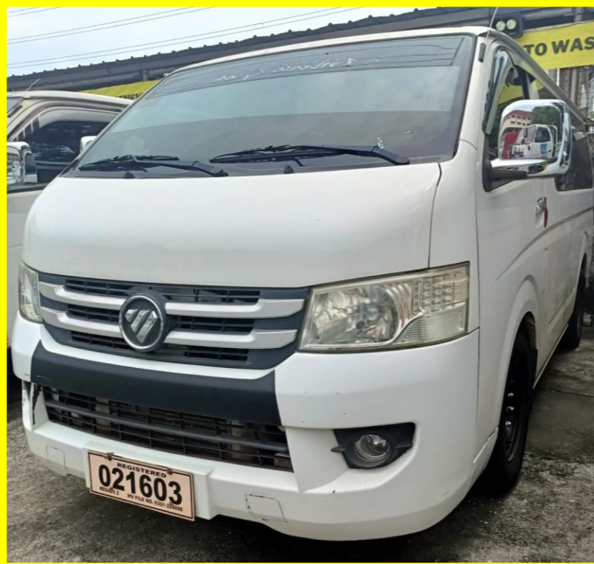
Plate No. : 021603 Location : Dr. Santos Ave. (formerly Sucat Ave.), Parañaque City Odometer : 222,865 kms. Indicative Price : ₱ 100,500.00 (NEGOTIABLE)