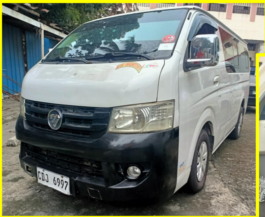
Plate No. : 021603 Location : Dr. Santos Ave. (formerly Sucat Ave.), Parañaque City Odometer : 386,844 kms. Indicative Price : ₱ 90,000.00 (NEGOTIABLE)